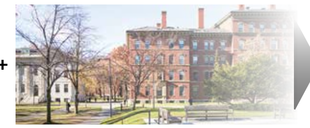
4 YEARS UNIVERSITY